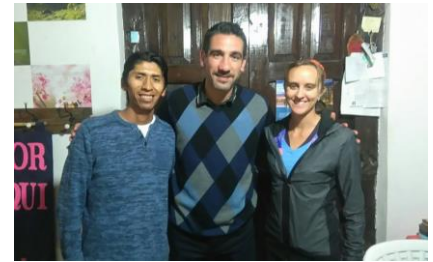
Who was visiting from Venezuela?

I hope you are refreshed after the Easter break and your days were filled with peace, reflection and celebration around the origin of this bank holiday! While there are similarities between rituals and celebrations across the world, here are a couple of traditions I consider unique to Cachi :