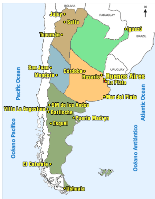
Argentina: it's a big place to get around!