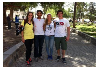
Surprise visit from Buenos Aires friends who briefly passed through Cachi last month

This may well be my last update of the year from Argentina, as on December 11 th we will be arriving into the UK! We will both be around until the end of January, and then I will stay on an extra month before returning to Argentina on February 24 th . We look forward to seeing as many of you as possible!