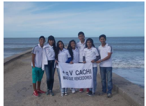
Young athletes from Cachi enjoying the beach in Mar del Plata