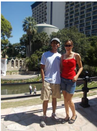
River Walk, San Antonio