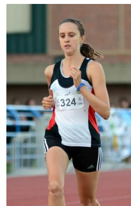
I will keep running for Jesus, however fast or slow, as long as He enables me to!

race-walking career and move into coaching. However, he is not completely done yet as he plans to represent Salta in the National Athletics Championships in December, hopefully getting a medal for the province; so he will be back in Mar del Plata in a couple of months! I am praying over whether I should attempt to join him or not, but it depends on our finances, my fitness and my eligibility, which I trust the Lord will make clear in time. Personally, although results have not been anything spectacular this year, I am thankful to be in much better health and able to train consistently; it is always nice to feel faster and to hold on to good form for longer periods of time but at least I am not bed-bound every couple of months! I trust that my body will continue to recover in God’s time , and I am learning that sports ministry as an athlete is not always about where you are on the rankings or the podium; of course, being high up can open many doors, but God is bigger than this and works through our relationships with others and our faithfulness to Him through the difficult and inexplicable moments. Thank you for continuing to pray for both of us in this area of our lives.