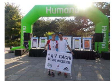
"+qV" even made it to Teas!