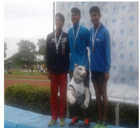
Hat trick gold for AR