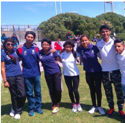
Sun’s out in Mar del Plata...