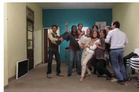
It all started so tenderly...next thing I know I was being hauled out!!

As always, MUCHAS GRACIAS for adventuring with us; may this journey bring a blessing to us all!