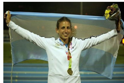
MP thrilled with claiming bronze in the 5000m; MB celebrates silver in style; AZ in better times, of which there are no doubt more to come.

My own sport has, overall, continued to progress well, despite a “bittersweet” March; two “bitter” challenges to my health- upset stomach and bout of flu- but two “sweet” comebacks- a personal best in an 8km road race and a good return to pre-virus form.