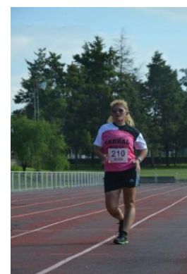
AR in action during a recent competition in Salta.